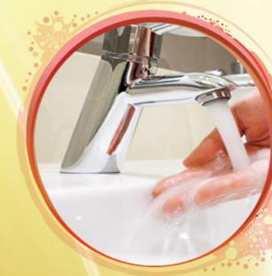
Water Treatment Plant