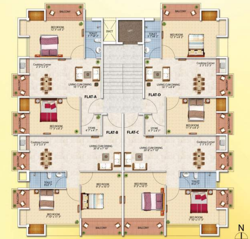
BLOCK 2 TYPICAL FLOOR PLAN