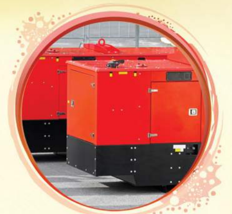
24 hrs Power Backup