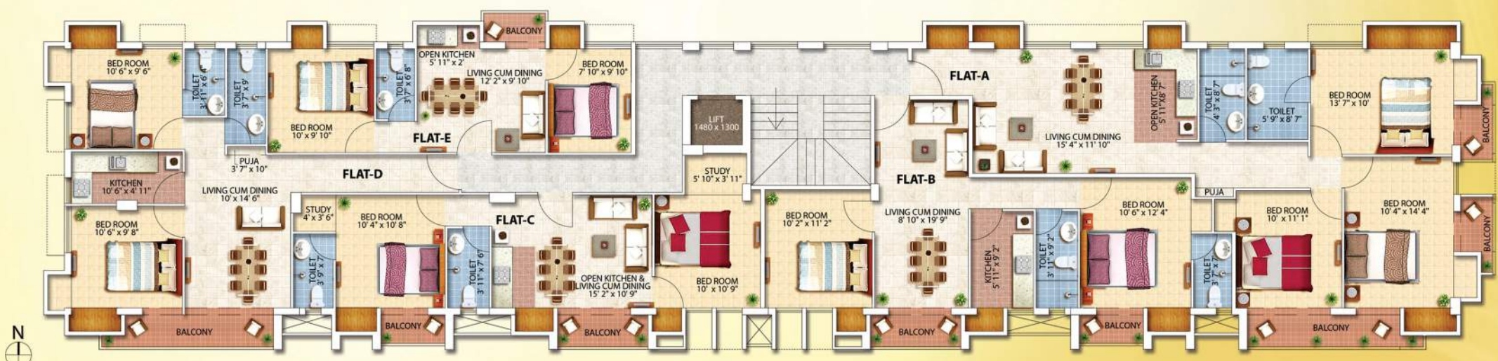
BLOCK 1 TYPICAL FLOOR PLAN